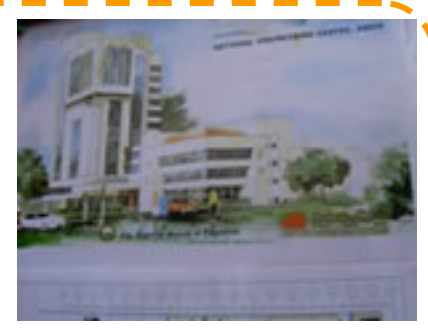
PROPOSED NEC CENTER