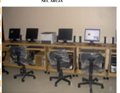
IT CENTER DONATED BY ISOC NIGERIA CHAPTER