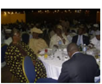
MEMBERS AT THE DINNER