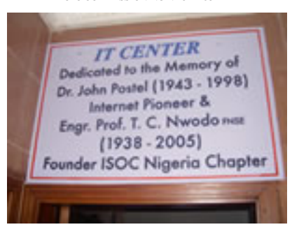
ENTRANCE OF THE IT CENTER