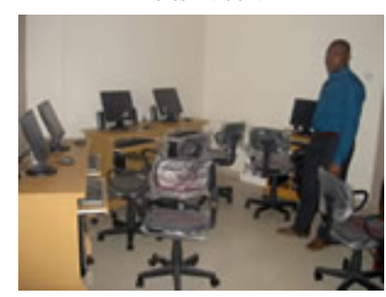
IT CENTER DONATED BY ISOC NIGERIA CHAPTER