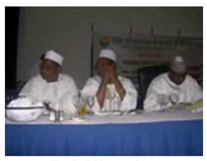
SOME GUESTS ON THE HIGH TABLE